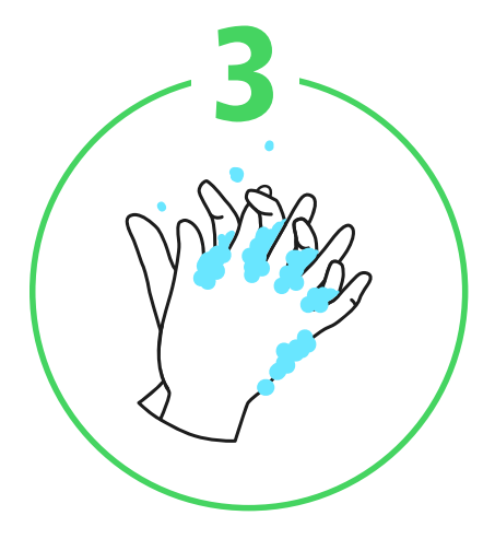
In between the fingers