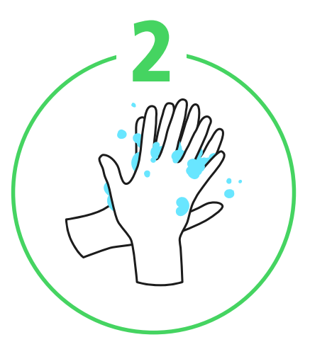
The backs of hands