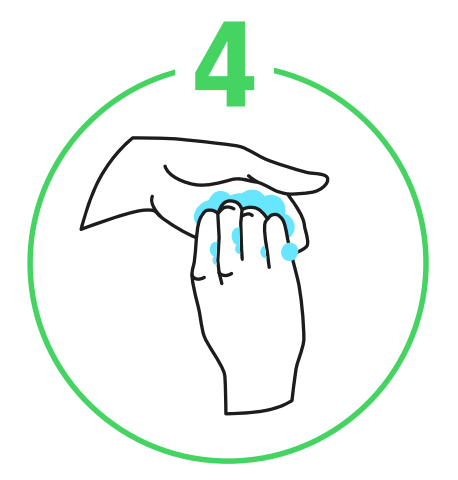
The back of the fingers