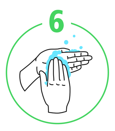
The tips of the fingers

Use a tissue to turn off the tap. Dry hands thoroughly.